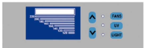
Microprocessor control system, LED display

Vertical Laminar Flow Cabinets VL-110 provide a particle-free working environment by taking air through a filtration system and exhausting it across a work surface in a laminar or unidirectional air stream.